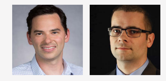
IDEA 3: Health agencies should expand harm reduction services. — Javier Cepeda, PhD, and Sean Travis Allen, DrPH

<u>Harm reduction</u> is an evidence-based public health strategy that focuses on positive change and working with people without judgment, coercion, discrimination, or requiring that people stop using drugs as a precondition of support. Evidence-based strategies grounded in harm reduction <u>reduce the risk</u> of overdose and transmission of infectious diseases including HIV and hepatitis C. These strategies include providing access to <u>naloxone</u>, <u>fentanyl testing</u>, and <u>sterile syringes</u>.